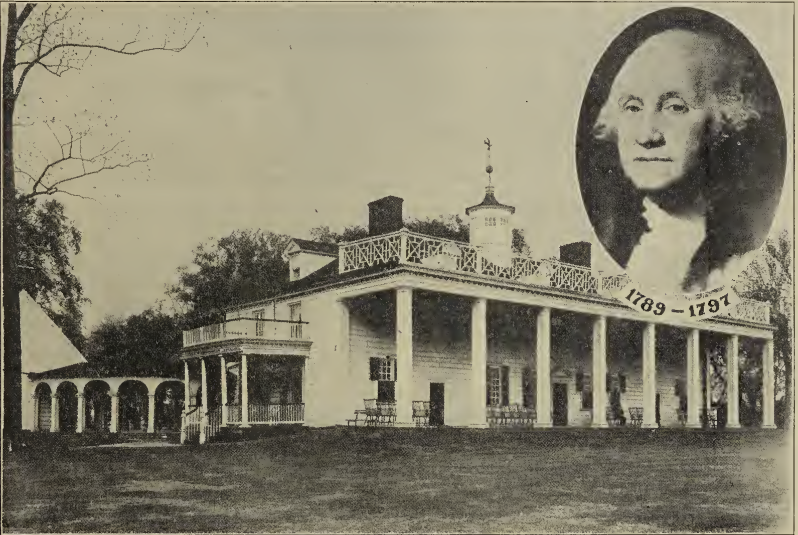
Wood's Seeds have been used for many years on the Mount Vernon Grounds